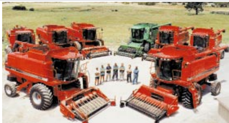
Part of the 'army' ready for the 1999 harvest

"These include the largest combine harvester ever built and a brand new rotary harvester – the first one in Australia."