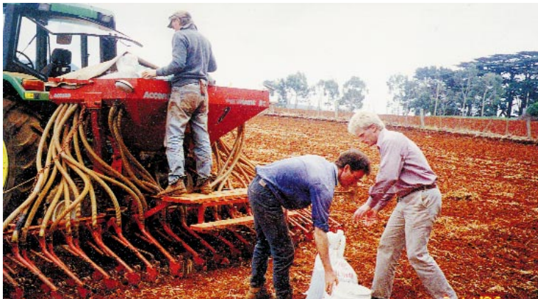
Preparation for drilling